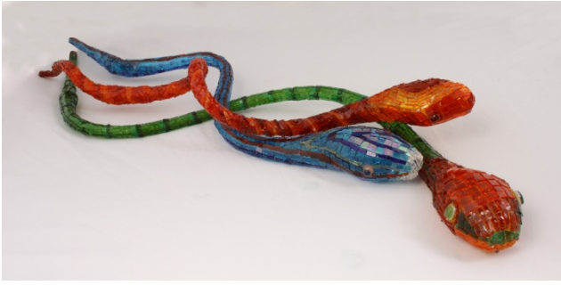
Snakes (Ozen Bozdağ)