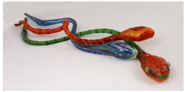
Snakes (Ozen Bozdağ)